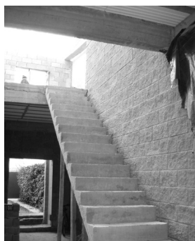
Photograph 2: The building under construction, viewed from the inner concrete block wall and stairs.

A two-storey high wall of concrete block provides thermal inertia accumulating heat in winter by incident solar radiation and delaying heating in summer when radiation does not reach the wall. Stone floor contributes to increment inertia. Besides, a heater has been placed by this wall to heat the two storeys through the void. Stairs have been separated 10 cm from this wall to let warm air rise (Photos (2, 3)).