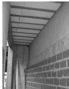
Photograph 1: Expanded polystyrene in upper floor and glass fibre inside double wall

combined with concrete reinforced beams in upper floor working together as a load bearing system (Photo 1).