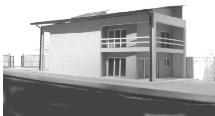
Photograph 4: SW view of the mock up. The SW wall is made of concrete blocks with additional insulation.