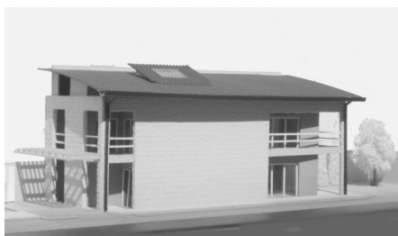
Photograph 3: NW view of the mock up. The stack device with the skylight can be seen in the roof