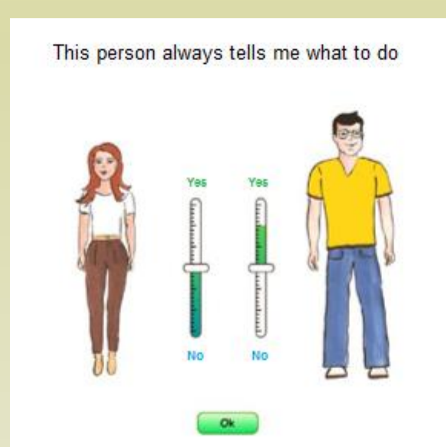
Figure 1. A print screen of the CFRT

Parental control was assessed using Restrictiveness scale (12 items) of the Computerized Family Relations Test – CFRT by Skoczeń et al. (2015). The response scale is continuous; with the use of a specially designed slider bar that is similar to a thermometer, the child is asked to indicate the extent to which he or she agrees that the item is applicable to each parent, ranking from totally agree (top scale) to totally disagree (bottom scale) as shown in Fig. 1.