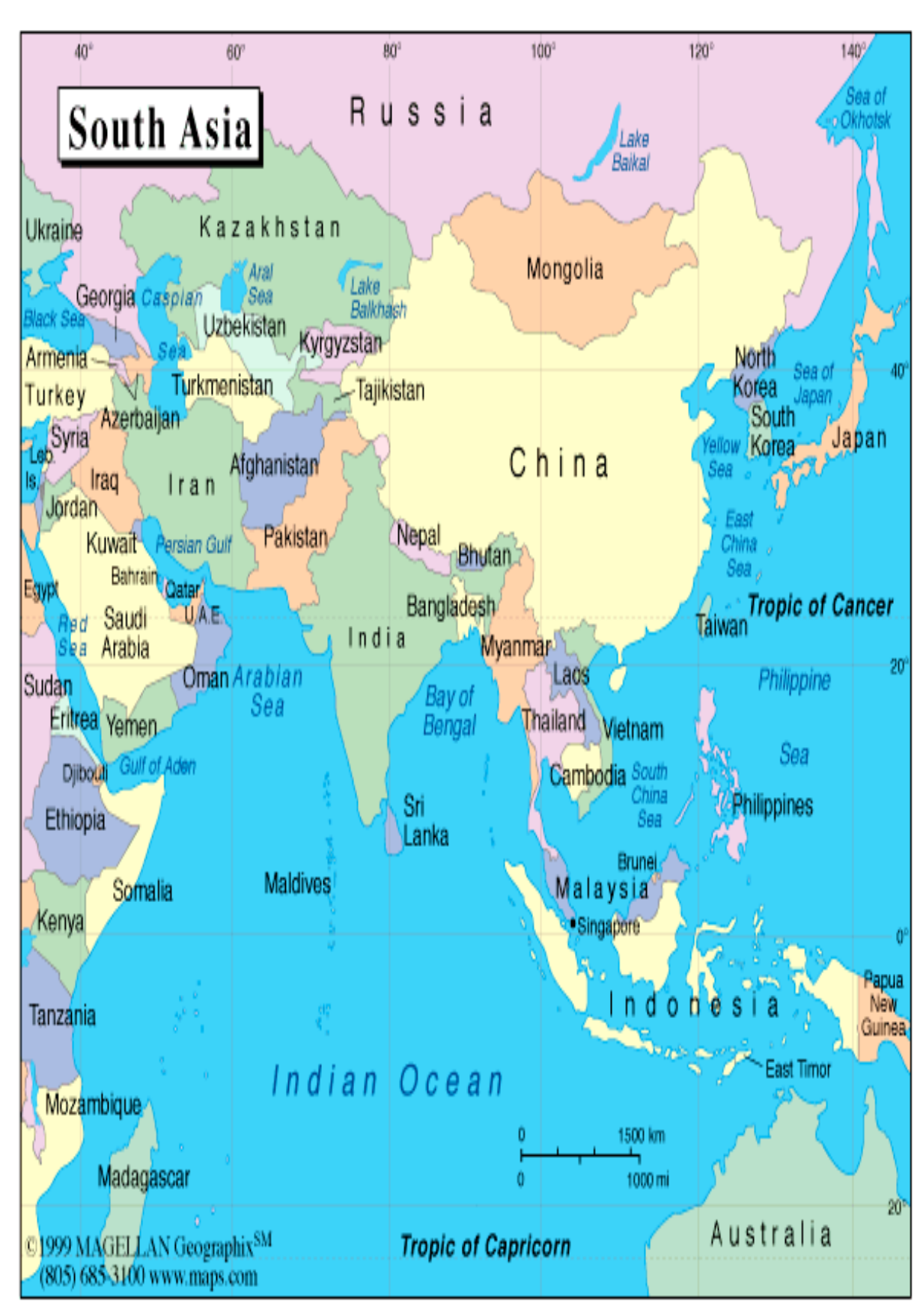
FIGURE 1: South Asia