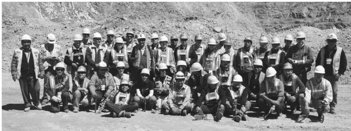
Metallogeny course field trip participants gather for a photo.