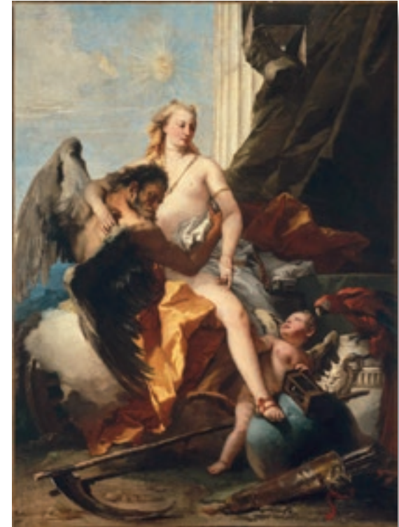
G. B. Tiepolo, Allegoria del Tempo che svela la Verità , c. 1758 (Museum of Fine Arts, Boston)