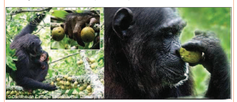
Because ripe figs come in many colours it can be difficult to tell which figs are ripe by just looking at them. They may look at the fig's colour, smell the fig (picture right), feel and squeeze the fig to tell how firm it is, or bite the fig to determine the stiffness of the fruit

Palpating, or feeling, the figs was about four times faster than detaching and then biting the fruit, suggesting that chimpanzees may have a substantial foraging advantage over birds and monkeys, which rely on visual and oral information.