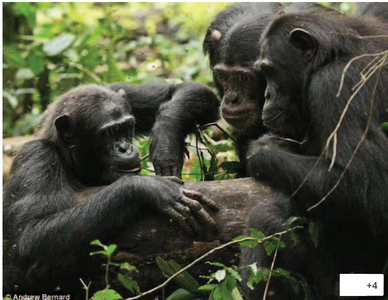
Dr Gruber said: 'The more chimpanzees travelled in the week prior to their interaction with the log, the more they were likely to use a tool when engaging with the log

New research suggests that chimpanzees who travel far and for long periods of time use tools more frequently to obtain food.