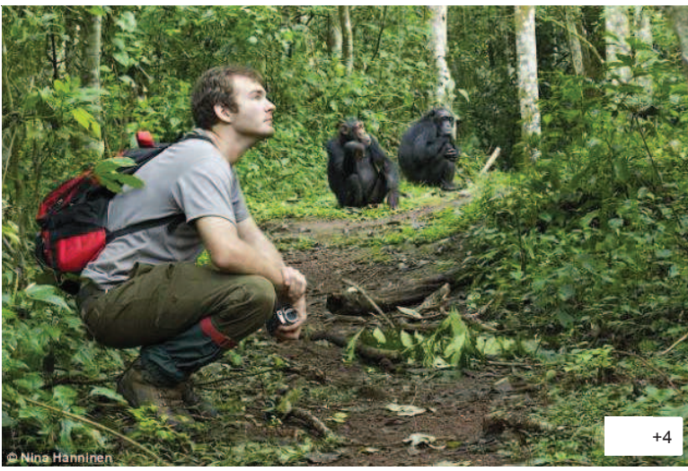
The paper, published in eLife brings together seven years of research into chimpanzee behaviour