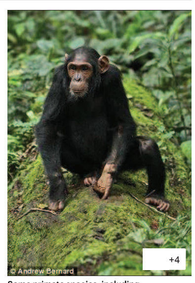
Some primate species, including chimpanzees, use basic tools such as sticks and leaves to get to food in hard-to-reach places

Contrary to what they expected, the team found that only longer trips, and not the lack of food, encouraged the