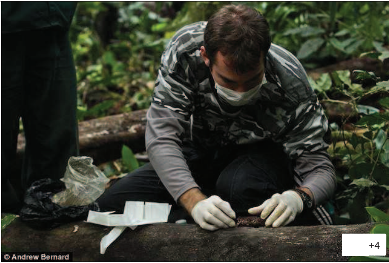
The researchers placed honey under a log to test whether the chimpanzees would use tools to attempt to reach the food

The secret lives of pets: Hidden cameras reveal