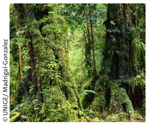
Species diversity allows great carbon storage only in equatorial and tropical rain forests, such as northern Chilean Patagonia Forest illustrated here.