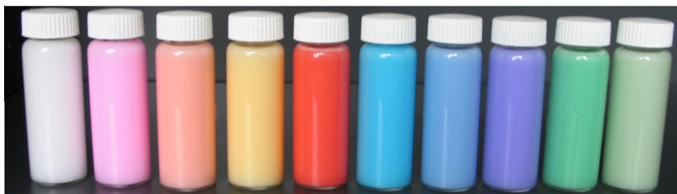
Fig. 3. Picture of the 10 colored fabric softeners presented in transparent containers (from left to right; white and pink, as provided in Experiment 1; peach; yellow; red; blue azure, as provided in Experiment 1; blue marine; purple; dark green, light green).

The Cotton perfume was matched with the white color by the highest percentage of respondents, followed by the blue marine color and the purple color (Table 2). Chi-square analysis indicated that the color-perfume match for this perfume was not random ( p -value = 0.021). As the Cotton perfume was initially created for a white fabric softener, most of the participants were in agreement with the expert color-perfume association. The Princess perfume was matched with the peach color by the highest percentage of respondents, followed by the yellow and pink colors; a total of 51% of the respondents chose these three colors. Chi-square analysis indicated that the color-perfume match for this perfume was not random ( p -value < 0.0001). The Lagoon perfume was matched with the blue marine color by the highest percentage of respondents, followed by the purple and blue azure colors; a total of 43% of the respondents chose these three blue nuances. Chi-square analysis indicated that the color-perfume match for this perfume was not random ( p -value = 0.034). The red and green colors were associated with these three perfumes only by a very low percent-