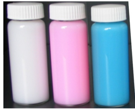
Fig. 1. Picture of the three colored fabric softeners presented in transparent containers (white, pink and blue azure).

The colored and perfumed fabric softeners were experimental products made by Firmenich, S.A., application laboratories. They consisted of a white commercial and nonperfumed fabric softener containing 12% of active softener ingredients. The fabric softeners were then perfumed by our internal application teams with one of three perfume variants (Cotton, Lagoon, and Princess perfumes from the Firmenich perfume collection added at 1.2%) and