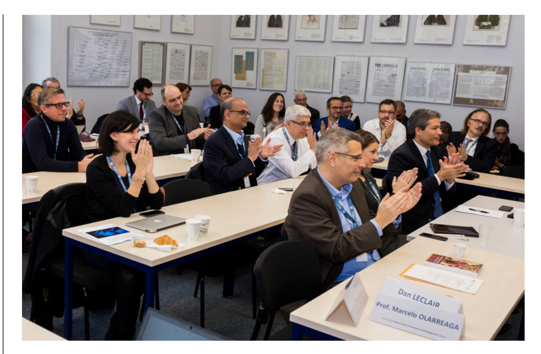
1st Meeting of the Global Business School Network for Human Rights (2017)

Specifically, this document provides an overview of readily available teaching resources, research outlets, and various ways of institutionalizing human rights at business schools. It includes contributions from representatives of schools that are already including human rights in classes, public programs, and research. These testimonies highlight some of the key building blocks for successfully integrating human rights into the business curriculum. The appendix provides a list of contacts at key business schools that stand ready to offer you further advice on how to initiate a human rights program at your school.