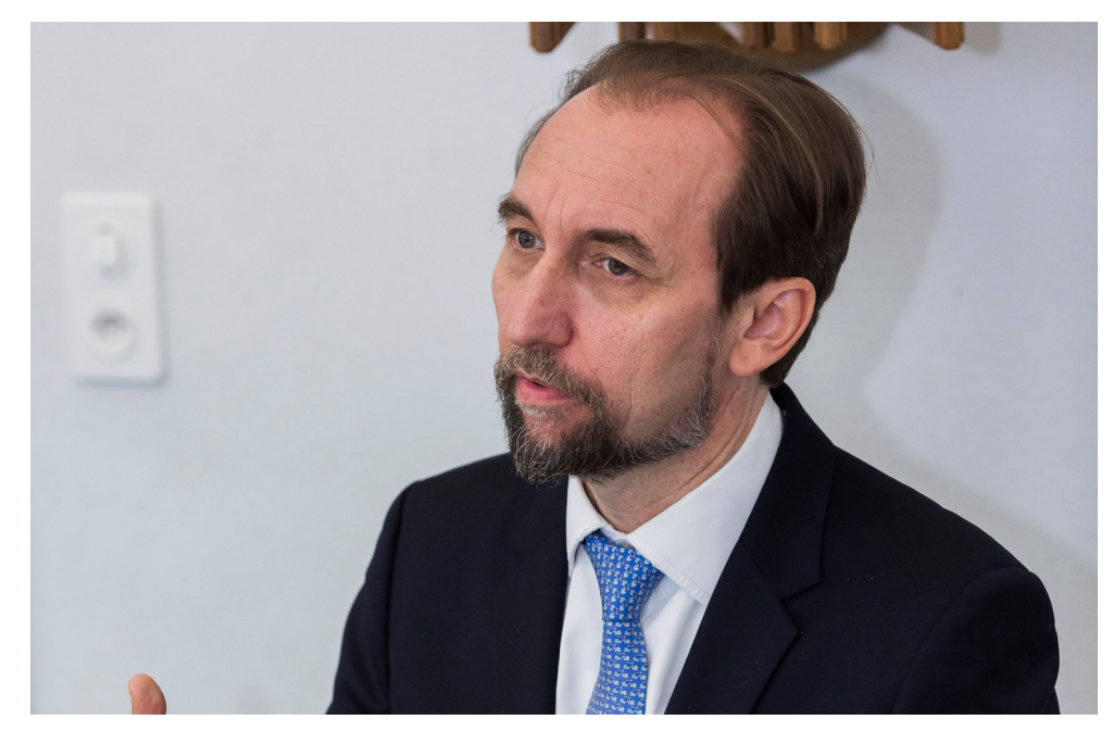
Zeid Ra'ad Al Hussein, OHCHR, Former High Commissioner