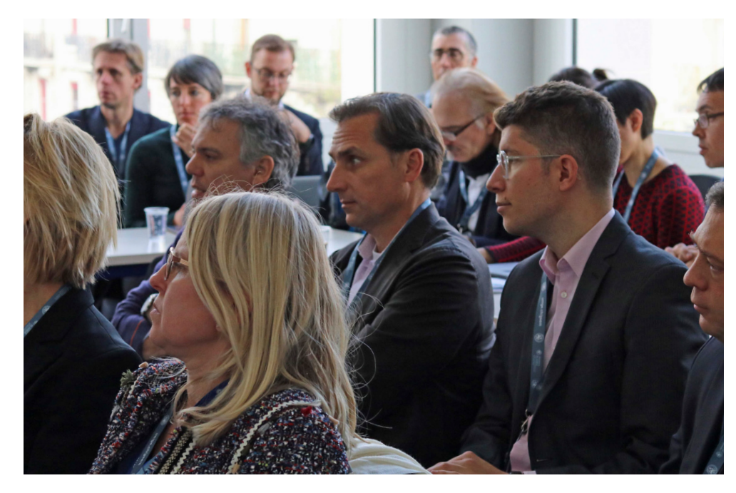
2nd Meeting of the Global Business School Network for Human Rights (2018)