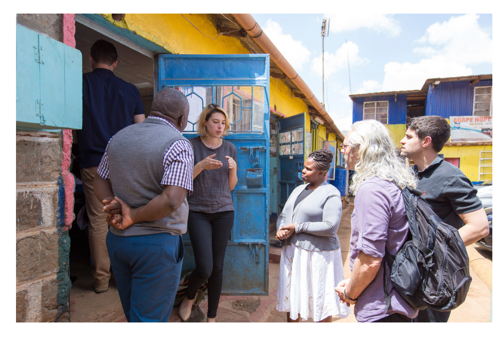
NYU Stern Signature Project on Business and Human Rights (Kenya 2017)