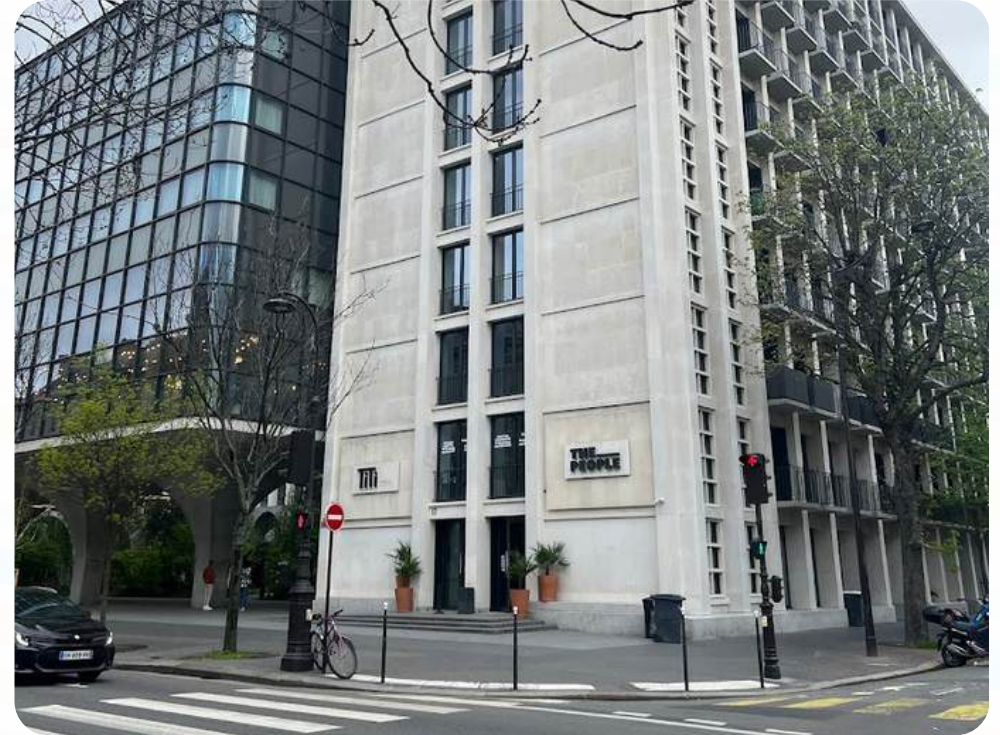
The People Paris Marais, 17 Bd Morland, 75004 Paris.