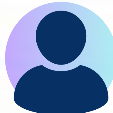
Surprise Jury Member

President and Co-Founder of Phenomenal Women Global