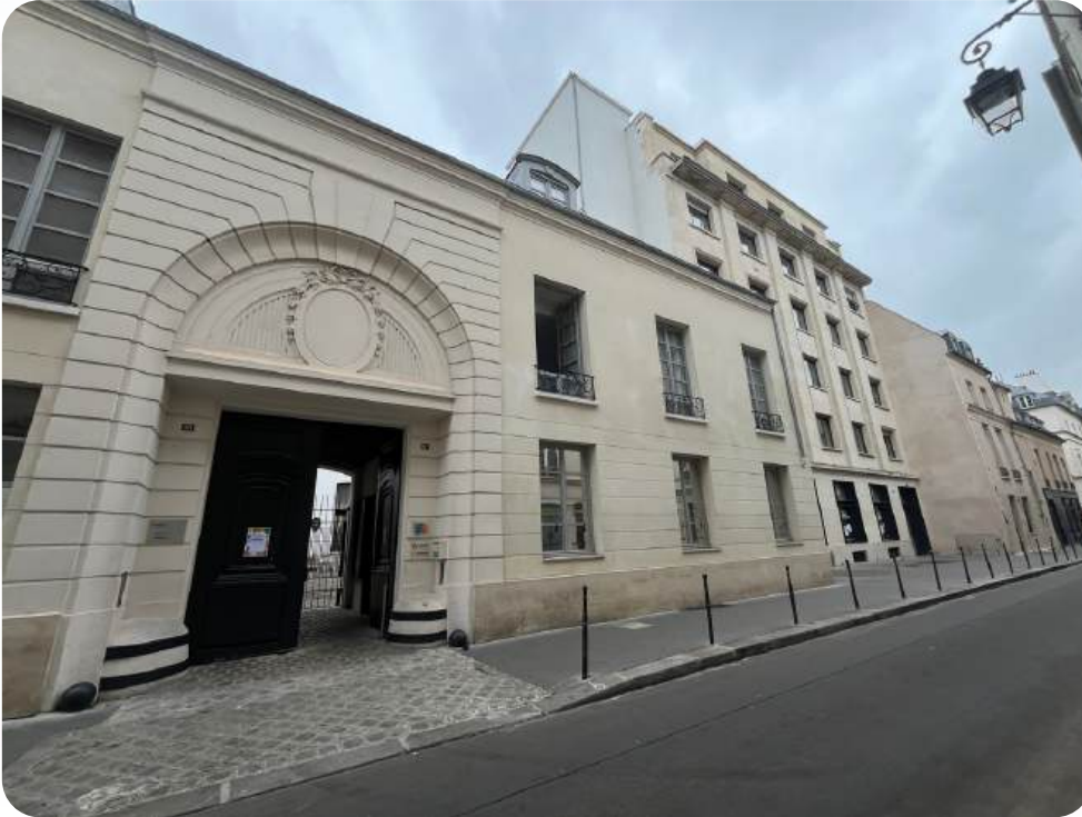
Learning Planet Institute, 8 bis Rue Charles V, 75004 Paris.