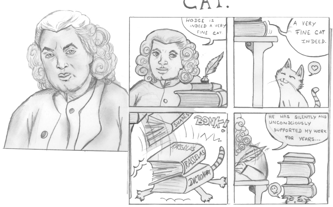
BY ELLEN DE MEESTER