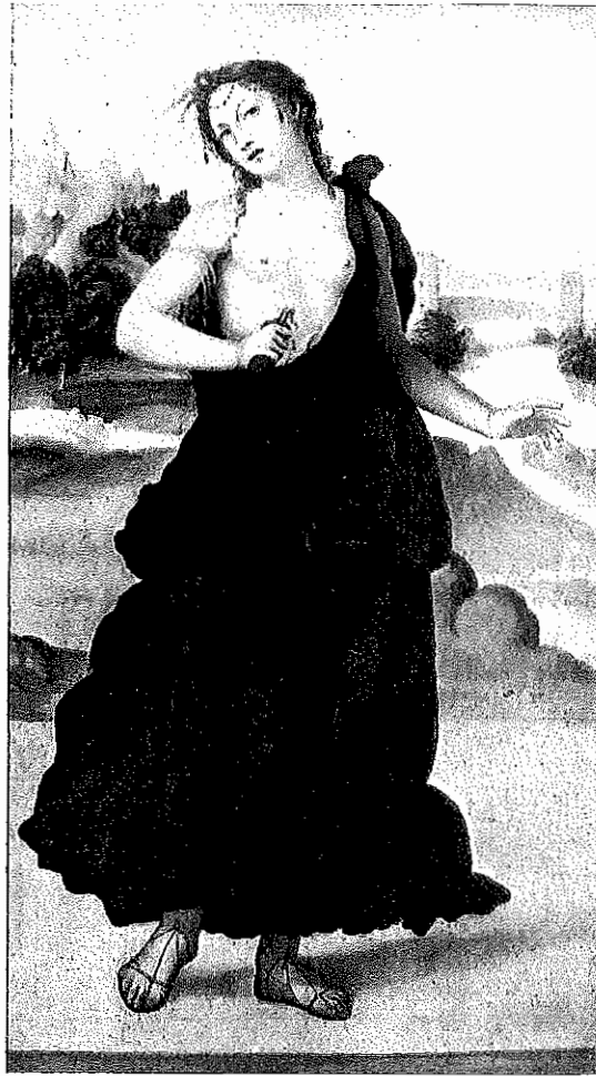
1. Sodoma, Lucretia . Hanover, Kestner-Museum.

of a sister and of a daughter of Lorenzo 17 . Now it is true that there existed many other famous Lucrezias at that time—I mention only Lucrezia Borgia and Lucrezia d'Este. However, not only is it quite probable that this fact did favor the existence of Lucretia paintings in such circles (Lucrezia d'Este-Bentivoglio was a patron of Francesco Francia who did one of the earliest single Lucretia pictures) 18 but there is also other important evidence for Leo's very special interest in the legend