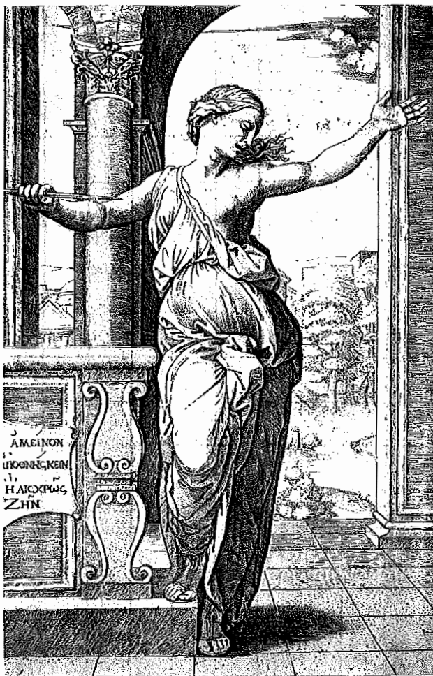
2. Marcantonio Raimondi, Lucretia, Engraving.

tained in many of its imitations and emulations among which I mention an engraving by Giacomo Francia who put his Lucretia before a niche 26 ; the completely nude figure of Lucas van Leyden's engraving of ca. 1513 27 from which a follower of Konrat Meit adapted his boxwood and bronze versions, thus translating the motif into real sculpture 28 ; and Scorel's free copy after Marcantonio's engraving