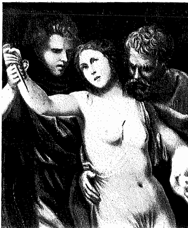
3. Sodoma, Lucretia. Budapest, Private Collection.