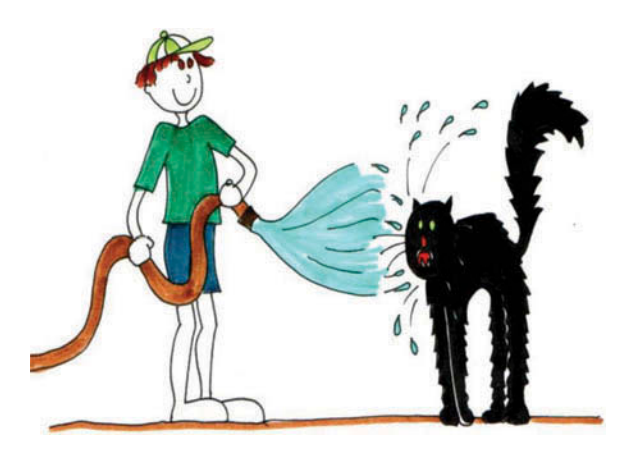
Figure 1. Sample test picture.

In order to establish what the target situation was, we also tested adult native controls in each language: Catalan (27 adults), Croatian (10 adults), Cypriot Greek (8 adults), Danish (8 adults), Dutch (15 adults), English (5 adults), French (10 adults), German (8 adults), Greek (10 adults), Hebrew (10 adults), Italian (13 adults), Polish (12 adults), Portuguese (10 adults), Romanian (12 adults), Serbian (10 adults), and Spanish (20 adults). This was particularly necessary for the languages in which the use of pronominals may be complicated by the presence of some other option (e.g., null objects are an option in European Portuguese or in French, although under different conditions).