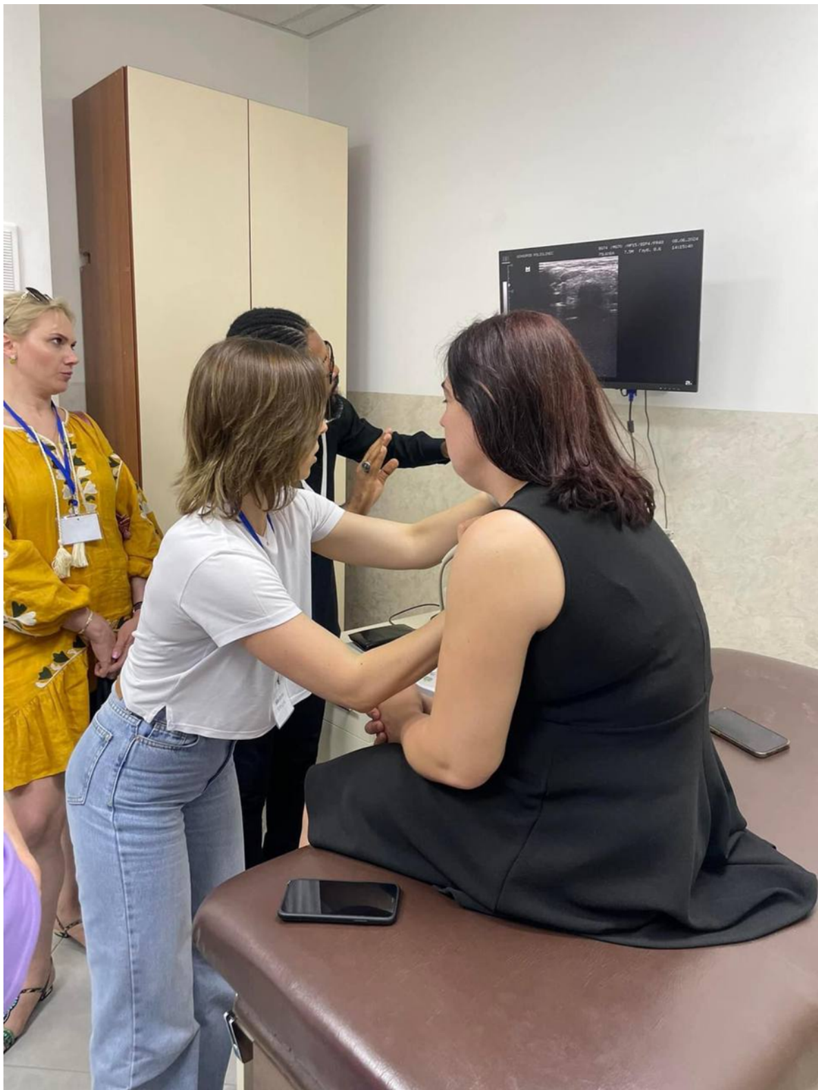
Point of Care in Ultrasound Diagnostics