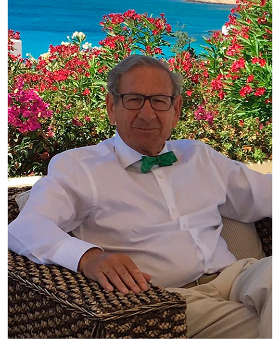
Fig. 1. Lelio Orci in Paros, Greece (2016).

Orci and his team developed the immunogold technique for the ultrastructural localization of intracellular proteins, and particularly hormones. By combining this methodological approach with radioactive labeling