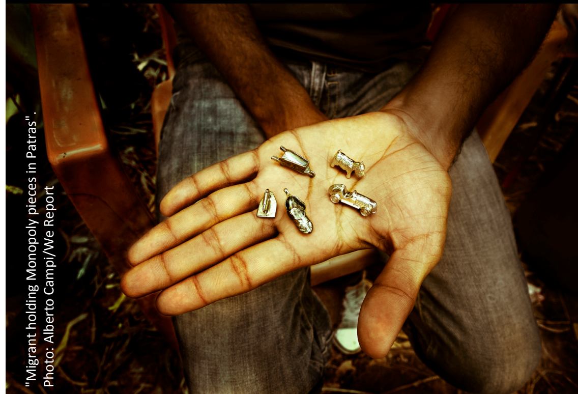
"Migrant holding Monopoly pieces in Patras".