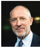
Prof. Henry Peter Head