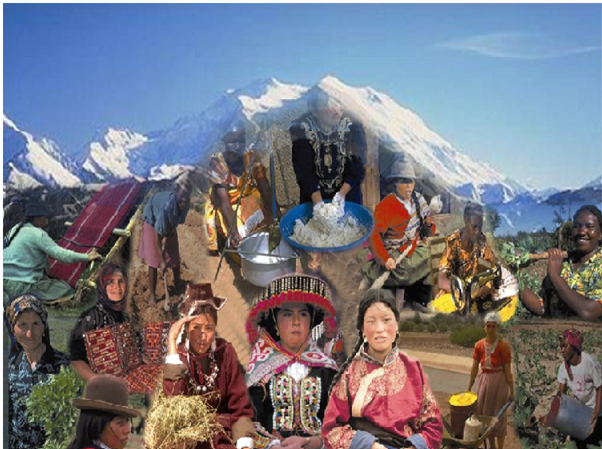
Figure 2: Photomontage presented at the “Celebrating Mountain Women” conference illustrating the diversity of mountain women.

Even though the making of such a gendered category appears to be relevant for actors with a global perspective on mountains, which is distanced from and syncretical of regional situations, the category is of little relevance for the primary subjects concerned – the women in the mountains themselves. This phenomenon can be partly explained by the themes addressed and the geographical scale mobilized. The social categorization within the global mountain agenda has also proven to have no tangible impacts that we could clearly identify or that “mountain women” advocating their cause could pinpoint. Indeed, one can hardly argue that mountain women’s lives have actually been improved through the attention drawn to gender dimensions of the global mountain agenda. Though “mountain woman” is a clear social identity within the