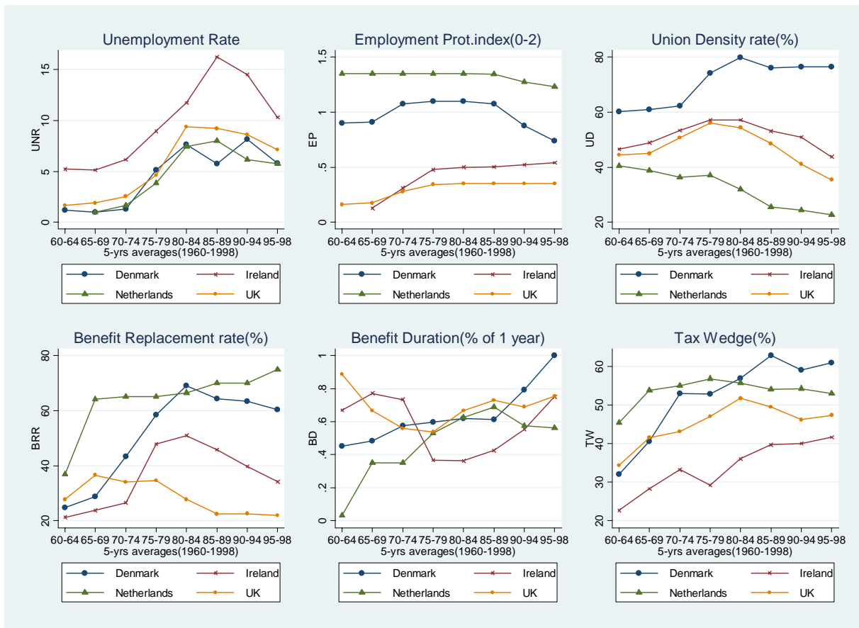
Figure 2: The Trajectory of Unemployment and Labor Market Institutions in Denmark, the Ireland, the Netherlands, and the UK