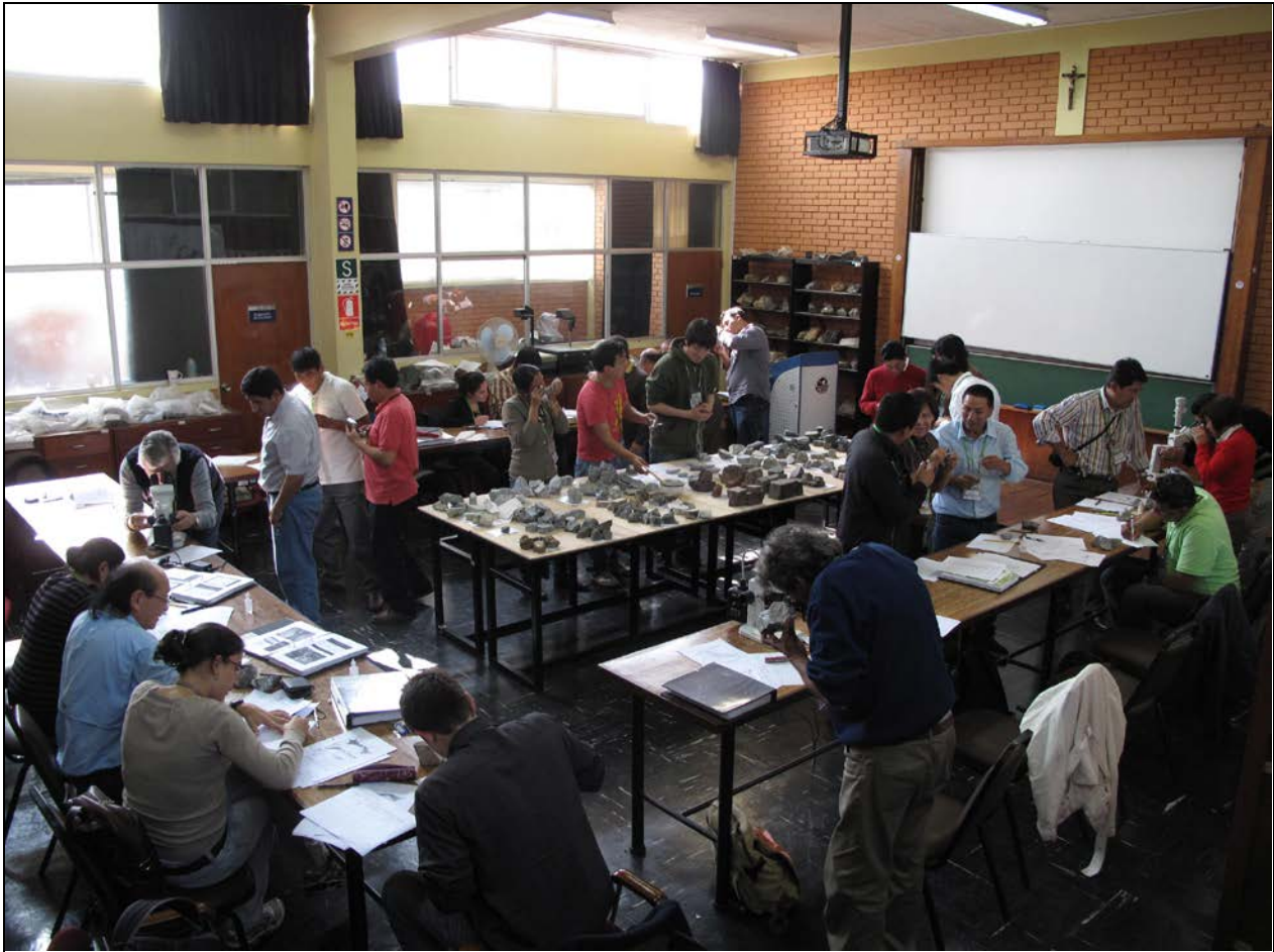
The labs for recognition of typical ores and alteration assemblages were a great success.