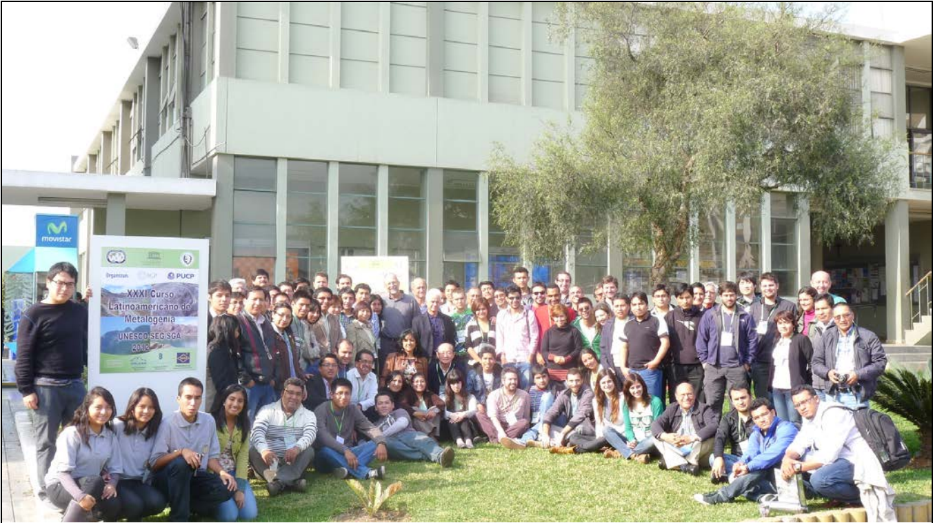
The course venue at the PUCP Lima