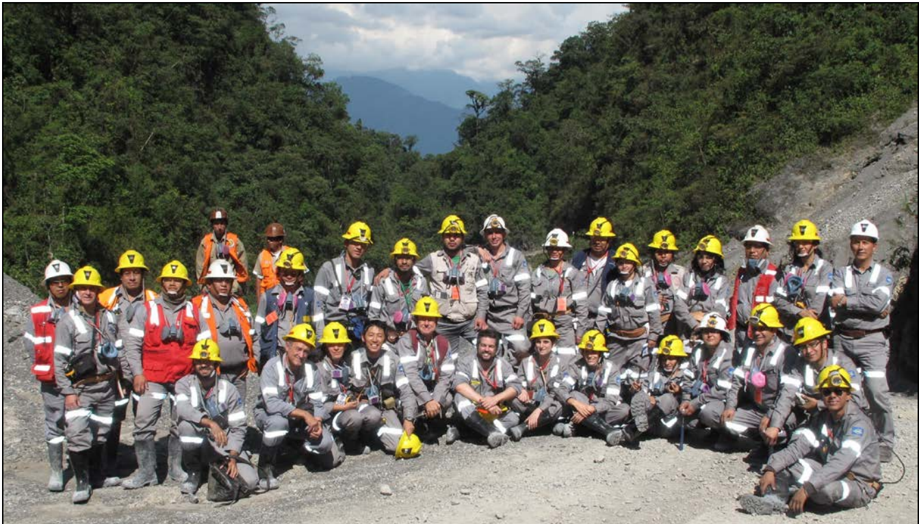
The field trip participants after their visit to the spectacular MVT San Vicente deposit