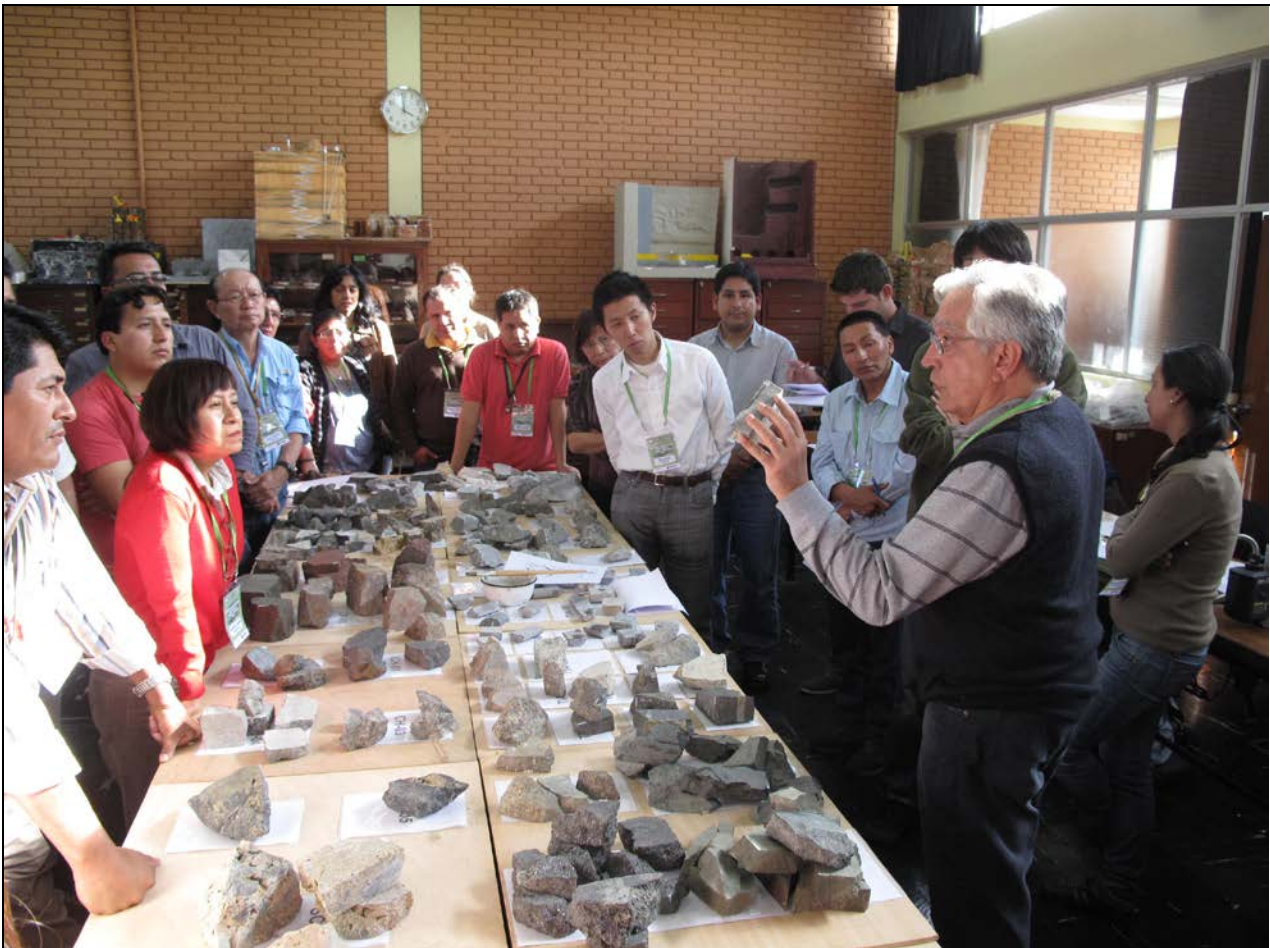
The labs for recognition of typical ores and alteration assemblages were a great success.