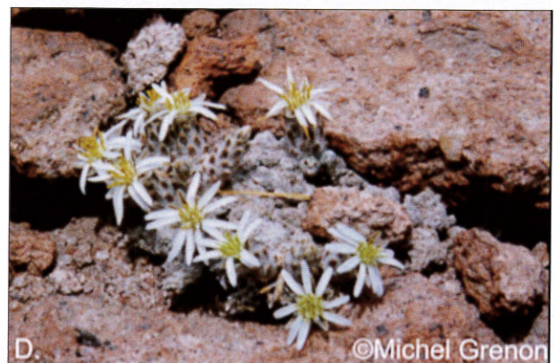
The genus Oriastrum is found in the mid- to high elevation southern Andes, often scattered in remote locations. Thanks to the generosity of numerous photographers this research was able to use superb images of species to further understand the variation and evolution in these high-elevation dwarf Asteraceae from the Chilean and Argentinian Andes. A. O. gnaphalioides (Paso Agua Negra, Coquimbo). B. O. abbreviatum (Calchaquies, Tucumán, Argentina). C. O. lycopodioides (Valle Nevado, Santiago). D. O. revolutum (Paso de Jama, Antofagasta).