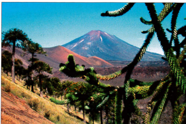
Volcán Lonquimay and Araucaria woodland, Chile. February 2002.

Chaetanthera Ruiz & Pav. (30 species, 1 variety, 2 hybrid forms) and Oriastrum Poepp. & Endl. (18 species, 1 variety) are among the most species-rich Astereaceae genera of the Chilean Flora. Formerly combined under one name, the two genera have been extensively revised. Chaetanthera is found mainly in Chile, with one Peruvian species and several scattered populations of other species in Andean Argentina. Oriastrum inhabits the higher elevations of the Andes, spread over Chile, Argentina, Bolivia and Peru. Systematic studies focussing on morphological and anatomical variation of characters taken from habit, involucre bracts, and achenes, combined with published palynological and genetic (nr DNA) information are used to circumscribe Chaetanthera with two subgenera – Chaetanthera subgenus Chaetanthera and Chaetanthera subgenus Tylloma (D. Don) Less., and reinstate Oriastrum with two subgenera – Oriastrum sub-