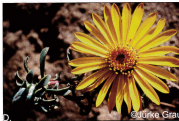
Linking the past with the present. Botanists have recognized the variation in the Chaetanthera subgenus Tylloma group of Chilean taxa for nearly 200 years. Modern analysis has enabled the complexities of this group to be revealed. A. An image of nomenclatural type material held in Geneva of Tylloma glabratum DC. Collected in Chile by Macrae in 1825 and annotated by A.-P. De Candolle himself, who described it as a new species in 1838. B. A closely related species, C. limbata , first described in 1830. Here it is, photographed in La Silla, Coquimbo. C. A species new to science - C. pubescens . D. C. frayjorgensis , a new name for a commonly collected plant.

genus Oriastrum and Oriastrum subgenus Egania (J. Rémy) A.M.R. Davies. Character variation is discussed in the context of form, function and habitat, with emphasis on the evolutionary adaptiveness of character traits seen in the two allied genera. Chaetanthera appears to show primary adaptation to cold and several secondary adaptations to arid conditions, typical of modern Chilean landscapes. Oriastrum taxa appear well-adapted to the cold, high elevations of the Andes, and show secondary developments trending towards an insular syndrome. The collated bio-geographical information of the taxa is considered in terms of endemism, hotspots and species radiations. Chaetanthera taxa have 2 loci of diversity hotspots in Chile – in Coquimbo and in Santiago. Trichome diversity and capitula morphology trends are used as evidence of species radiations in Chaetanthera . Oriastrum taxa are notable for parallel radiations of morphologically similar species within particular Andean zones: i.e., Altoandino or Altiplano. Case studies concerning three groups of Chaetanthera taxa are presented. The first case highlights the